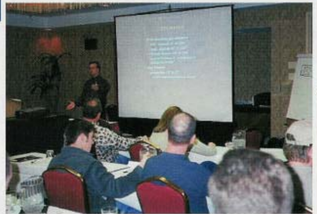
Instructor-led classes held throughout the country can help your company become EIFSmart.

Since one complaint has been about the time lost to employees going to the seminar, AWCI has devised a video program with five copies of the workbook, for