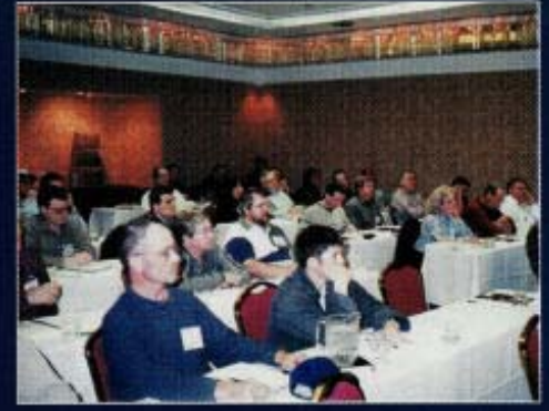
The courses can be used to teach proper EIFS application to mechanics, inspectors and industry professionals.

of Architects to have the certifications included in architects' specifications." AWCI is also working closely with the EIFS Industry Members Association. In addition, AWCI is sending a mailing campaign to contractors, both members and nonmembers of the association, as well as to code officials, inspectors,