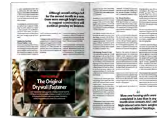
A 1/2 horizontal premium as it would appear on a left hand page.