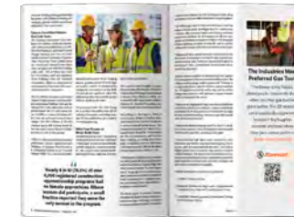
A 1/2 vertical premium as it would appear on a right hand page.