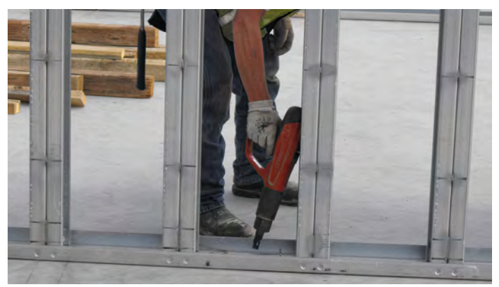
Powder actuated tools are tools powered by an explosive force that propels or discharges a fastening device. The energy comes from an explosive powder that is detonated by a primer.