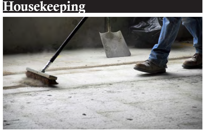
Housekeeping is the appropriate management of work areas to ensure that they are kept organized, tidy and safe to work in and around.