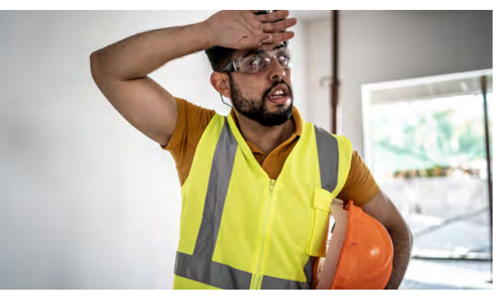
Heat illness prevention is a process of planning, establishing and implementing procedures to prevent workers from enduring any of the following heat-related illnesses: