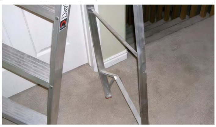
Damaged equipment is any construction equipment that has been damaged badly enough that it could cause worker injury.