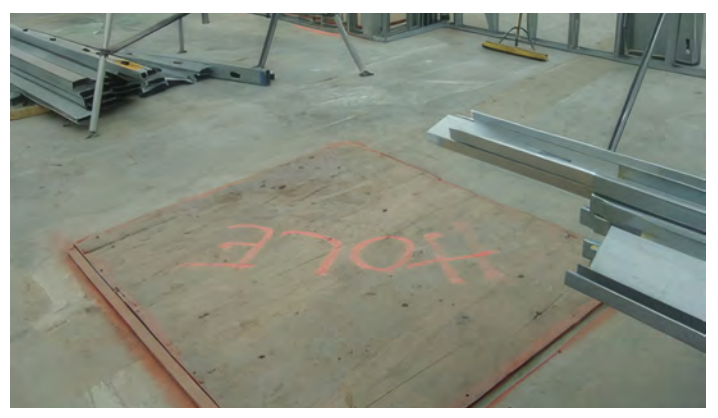
Fall prevention refers to methods that prevent workers from falling to a lower level. Fall prevention methods include guardrail systems, fall restraint systems and hole covers.