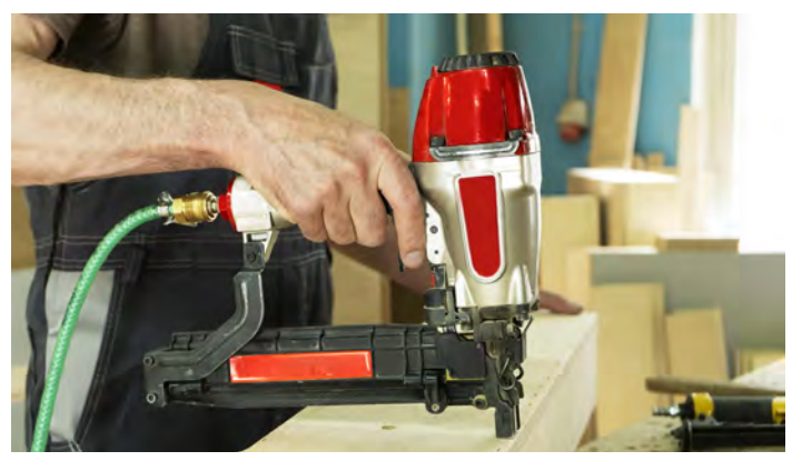
Pneumatic tools are tools powered by compressed air, which is supplied by an air compressor.