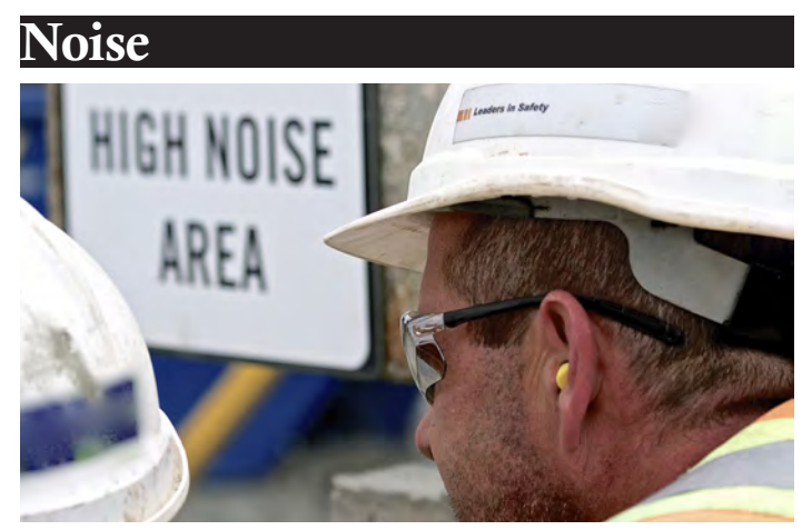
Noise is unwanted sound that is unpleasant, excessively loud or disruptive to hearing.