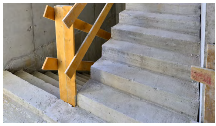
Stairways are sets of steps providing access to one level or another.